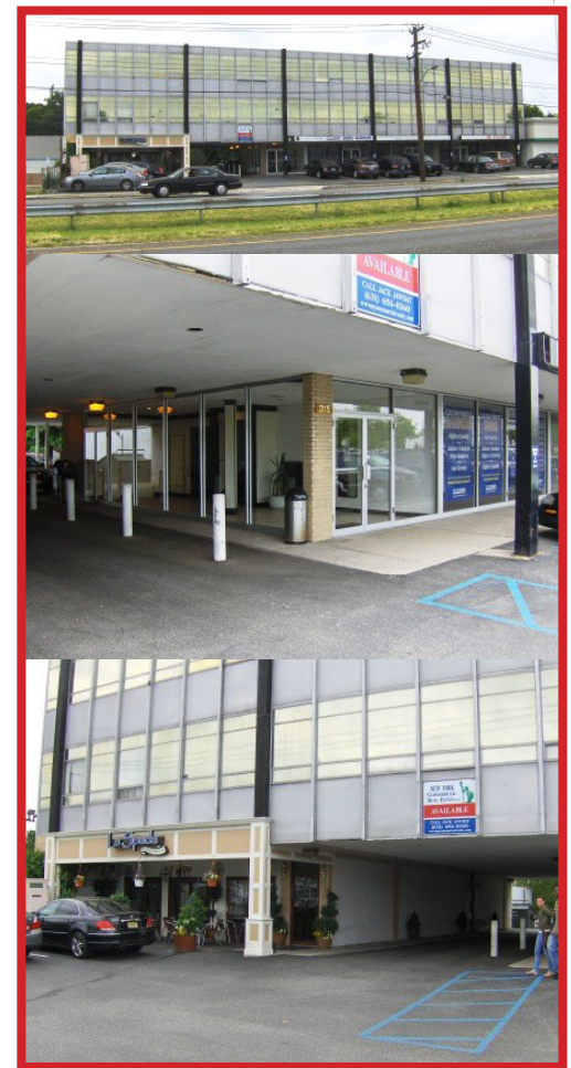
The property at 315 Walt Whitman Road in Huntington

Dunia listened to the clients’ needs and delivered accordingly and Pino’s attention to detail and ability to present new opportunities for buyers was a key factor in this sale.